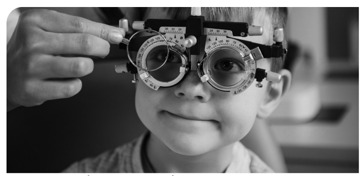
You may choose from the following vision plans: