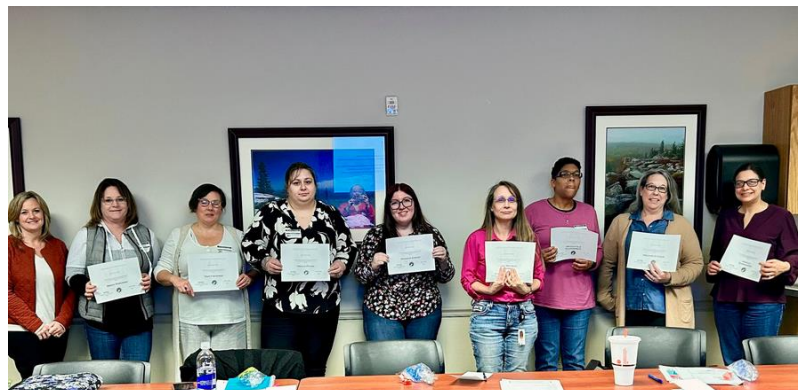
New Benefit Coordinators

Thank you to all Benefit Coordinators who took time out of their work schedule to attend the Open Enrollment Meetings. I believe that there was a lot of good conversation and networking. I look forward to the virtual Open Enrollment meetings on April 2 and 3. It is still open for BCs to attend, even if you already attended in person.